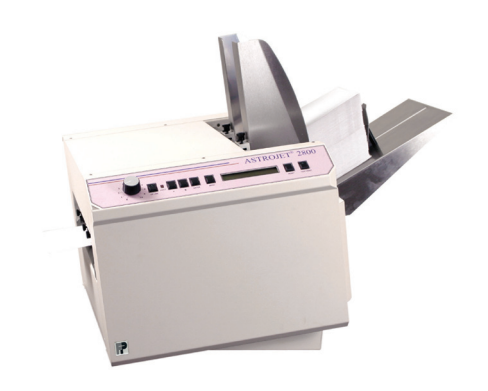
FP AJ-2650 and FP AJ-2800