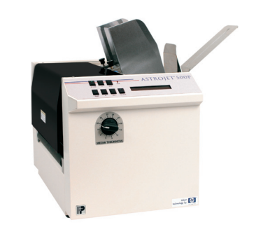
FP AJ-300 and FP AJ-500